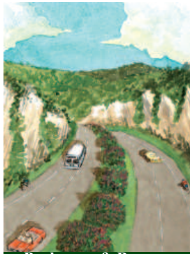
Parkways & Byways