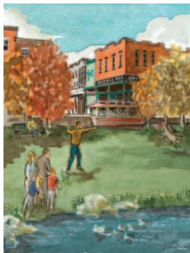
Parks & Preserves