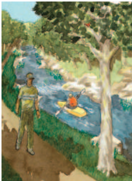
Greenways & Blueways